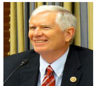
Congressman Mo Brooks